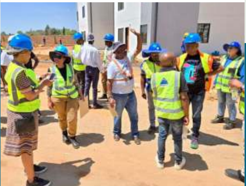
MMC and the Section 80 team during the recent oversight visit.

The oversight visit by MMC and the Section 80 team emphasizes the municipality's dynamic approach to the development of infrastructure and development in Emfuleni. MMC Mako has committed to revisit the sites to ensure smooth operations and that the objectives of the project are realized.