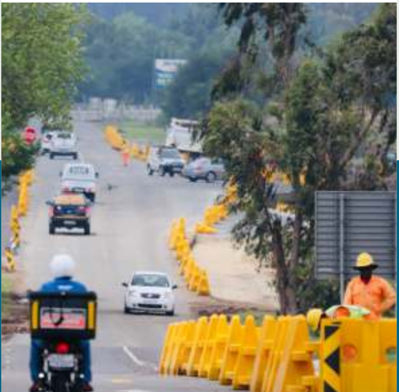
Upgrading of roads near North West University Vaal Campus

Provision or upgrading of roads, utilities, and services are necessary. Hearings and planning board or tribunal approvals allow for community input. Assessments to evaluate potential development impacts on the environment and traffic are also part of this process.