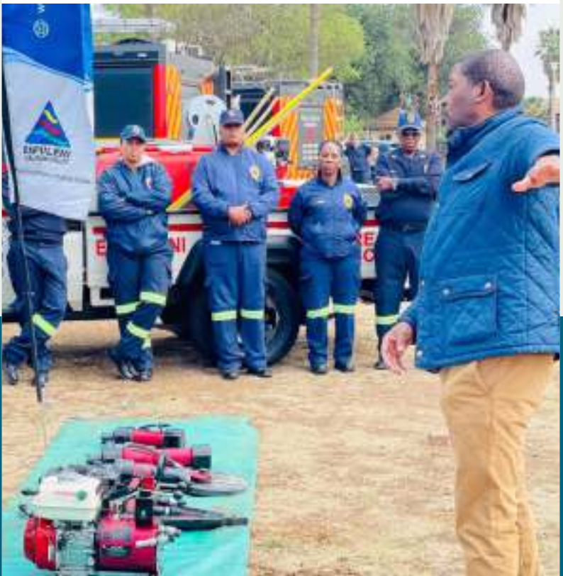
Executive Mayor Cllr Siphonela launched the New Grass Fire Units at Emfuleni Head Offices

In addition to practising fire safety, residents can report any fire-related incidents by contacting our emergency call centre on 087 310 9622, 087 310 9632 or 087 310 9633.