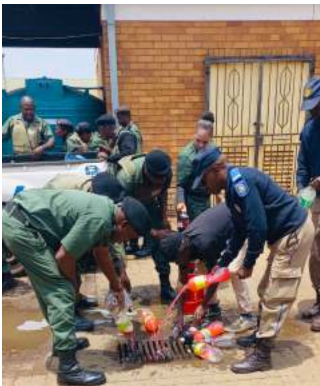
Law enforcement officers during recent operations discarding expired food items.

ELM is continuing with joint operations in order to mitigate the problems faced. Those caught with food items not for consumption will be apprehended and food items disposed of. Non-compliant spazas will be closed off and those contravening the law including illegal immigrants will be arrested. Emfuleni continues with registration of spaza shops. The municipality will continue to enhance its inspection teams, pulling more resources to enforce compliance of all spaza shops and food handling facilities.